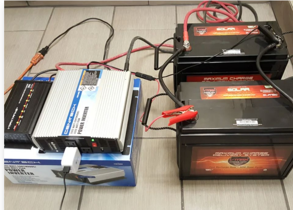
Image from https://www.instructables.com/How-to-Build-a-Battery-Backup-Generator